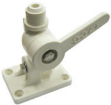
The MM1 folding base supplied as standard is constructed from toughened plastic.