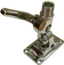
For those who prefer the ultimate in quality, durability and strength, the MM2 folding base is constructed entirely from stainless steel.