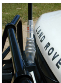
The 1269 spring as supplied with SGDB

A heavy duty and high quality stainless steel beehive spring, the 1269 has been successfully used on our popular SGDB antennas for decades.