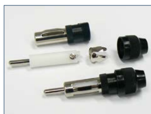
An “easy fit” solderless car radio connector is supplied.