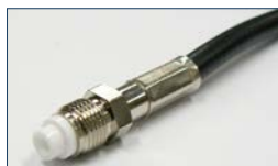
An FME Female connector is fitted to the 4.5 metre RG58 low loss stranded cable.