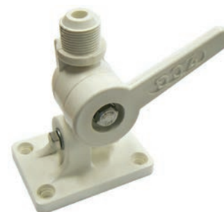
The MM1 folding deck mount supplied is constructed from toughened plastic.