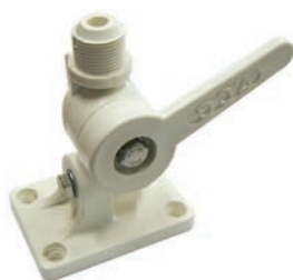
The MM1 folding deck mount supplied as standard is constructed from toughened plastic.