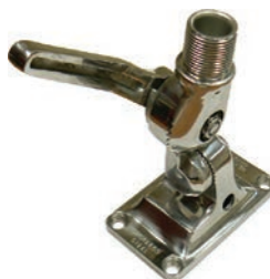
For those who prefer the ultimate in quality, durability and strength, the MM2 folding deck mount is constructed entirely from stainless steel.